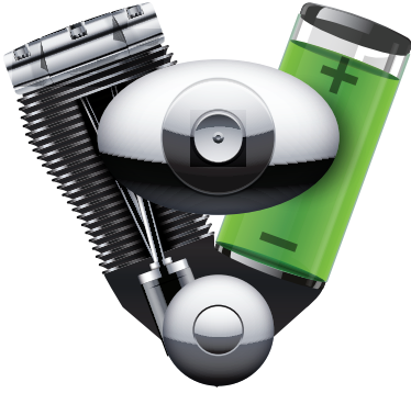
HEV HYBRID ELECTRIC VEHICLE